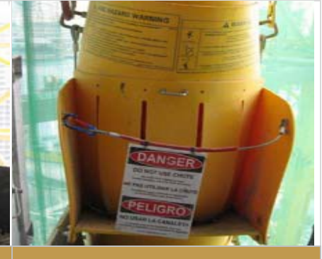
OPENINGS IN CHUTES